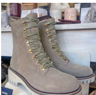
Boutique La Vega 3640 32nd Ave. A new women-owned Boutique La Vega has entered the contemporary accessory and apparel scene on 32nd Avenue with some seriously cool finds, $38-$200. Best Pick: Killer Boots, $175