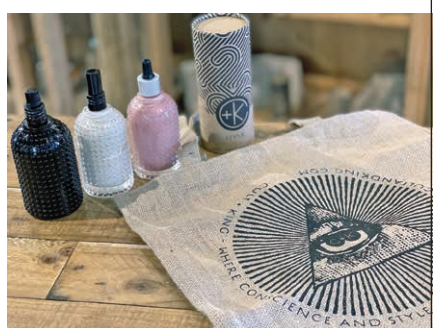
Best Pick: Cult + King, where conscience and style collide in hair potions and lotions, $18-$40.