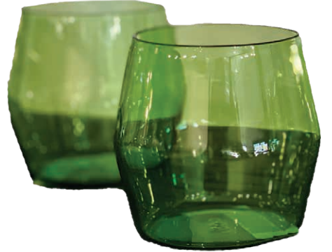
Form 4234 Tennyson St. Green glass tumblers, two for $34