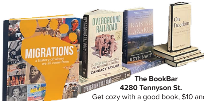
The BookBar 4280 Tennyson St. Get cozy with a good book, $10 and up