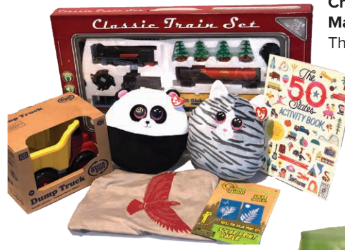
Children's Museum of Denver at Marsico Campus 2121 Museum Dr. The Gift Shop is full of unique and educational items perfect for kids (and grown-ups!) of all ages.