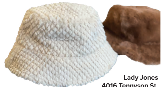
Lady Jones 4016 Tennyson St. The perfect plush bucket hat, $28-$69