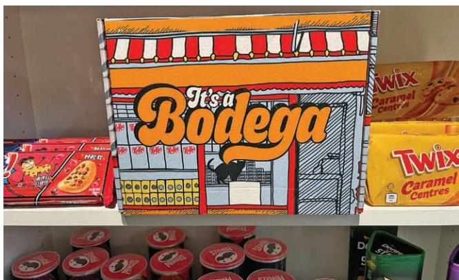
It's A Bodega – Edgewater Public Market 5505 W. 20th Ave. A whacky mix of toys, high-end trainers, men's leather jackets, hipster tees, and a bodega, $5-$1000. Best Pick: It's a Bodega mystery box filled with snacks, drinks and who knows what, $50.