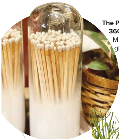
The Perfect Petal 3600 W. 32nd Ave. Matchsticks under glass, $38-$60