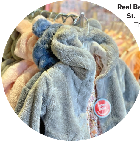
Real Baby 4315 Tennyson St. The perfect plush magnetic closure jacket, $50