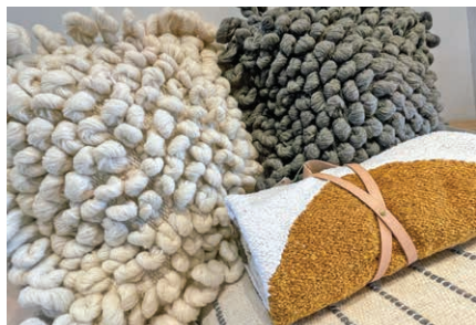
Mojave + Tejon Dry Goods 2436 W 44th Ave. Exquisitely handcrafted, curated collectibles, ceramics, leather, skin care, and apparel $10-$500. Best Pick: Hand-Loomed decorative cushions and blankets, $88-$118.

Berkeley Supply Company 4040 Tennyson St. Visit this beautifully reimagined and dramatically larger space for this menswear trailblazer since 2012. High quality apparel, denim, leather goods and accessories, $25 and up. Best Pick: Denim, $125-$400