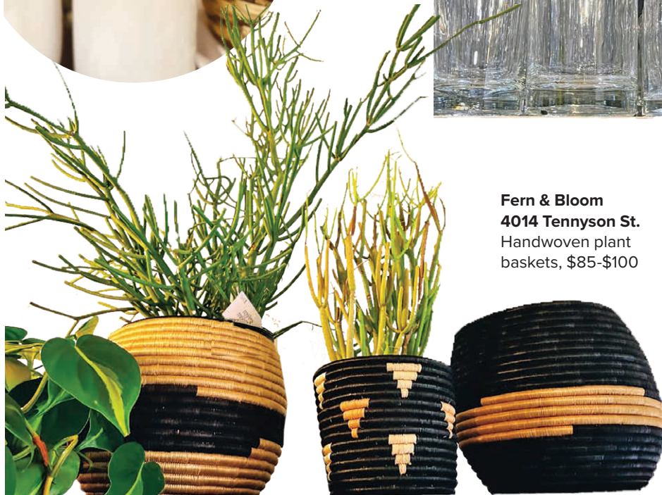
Fern & Bloom 4014 Tennyson St. Handwoven plant baskets, $85-$100