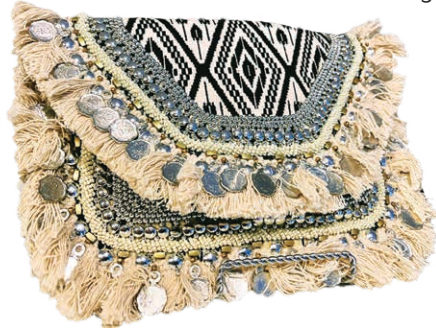
April & West 4162 Tennyson St. Handwoven straw & beaded bags, $65