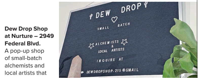
Dew Drop Shop at Nurture – 2949 Federal Blvd. A pop-up shop of small-batch alchemists and local artists that give back to worthy causes. $6-$50.