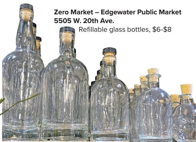
Zero Market – Edgewater Public Market 5505 W. 20th Ave. Refillable glass bottles, $6-$8