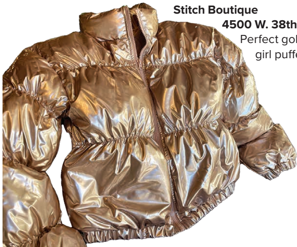
Stitch Boutique 4500 W. 38th Ave. Perfect golden girl puffer, $99