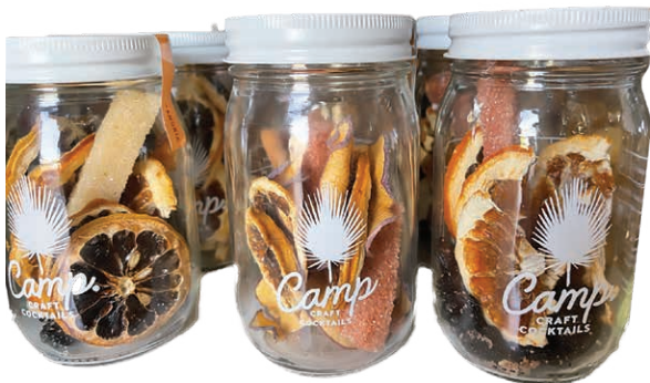
XO Gifts to Go 3843 Tennyson St. The ultimate gift to go, camp craft cocktails, $26