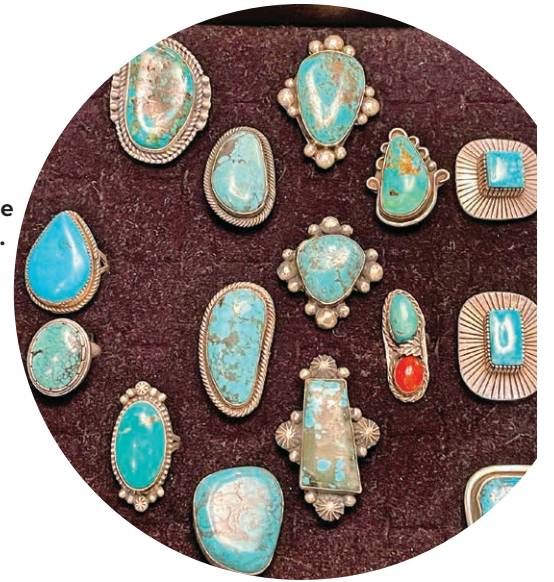
Clotheshorse 4232 Tennyson St. Native American turquoise rings, $100 and up